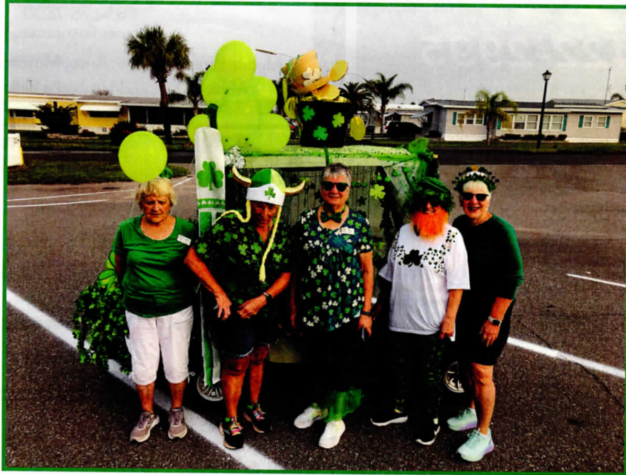
FIRST PLACE—The Quilt Club